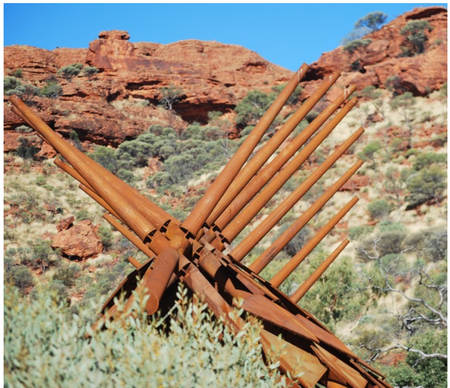
Watarrka National Park Visitor Information Shelter 2016 Parks and Wildlife Commission of the Northern Territory and Watarrka Traditional Owners

Tangentyere Design's work has been honoured by its peers, receiving numerous Australian Institute of Architects awards and commendations.