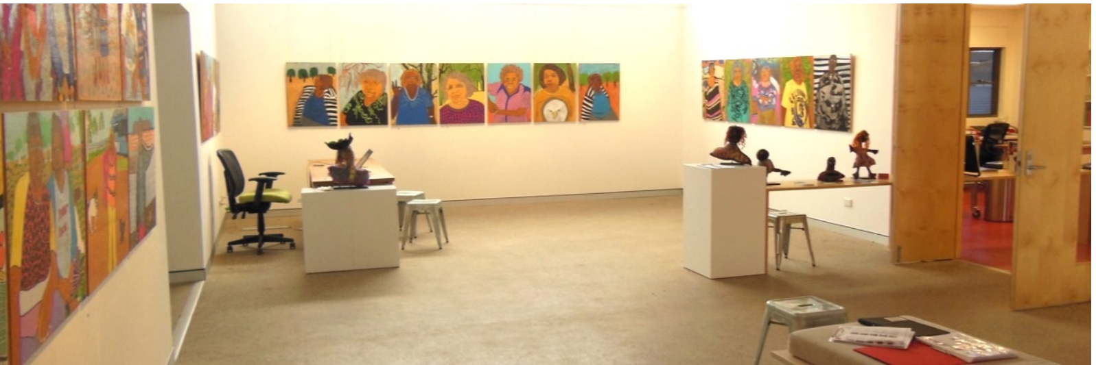
Tangentyere Artists Studio and Gallery 2014 Tangentyere Artists

Tangentyere Design regularly offers architectural advice on a pro bono basis to Town Camp residents, and to the social service divisions at Tangentyere Council. This may take the form of report and grant application writing, design workshops and preliminary costings for proposed capital works.